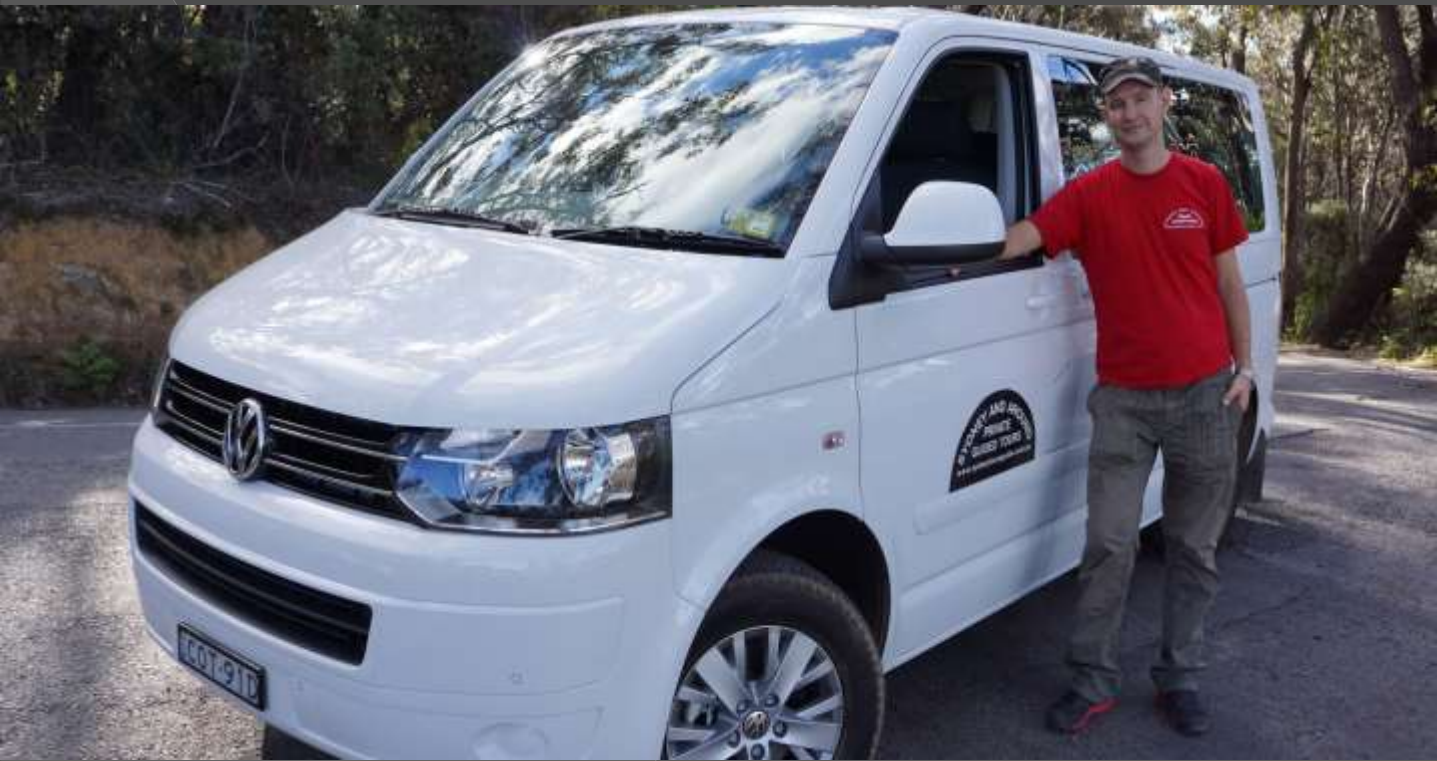
VW MULTIVAN COMFORT LINE 7 SEATS