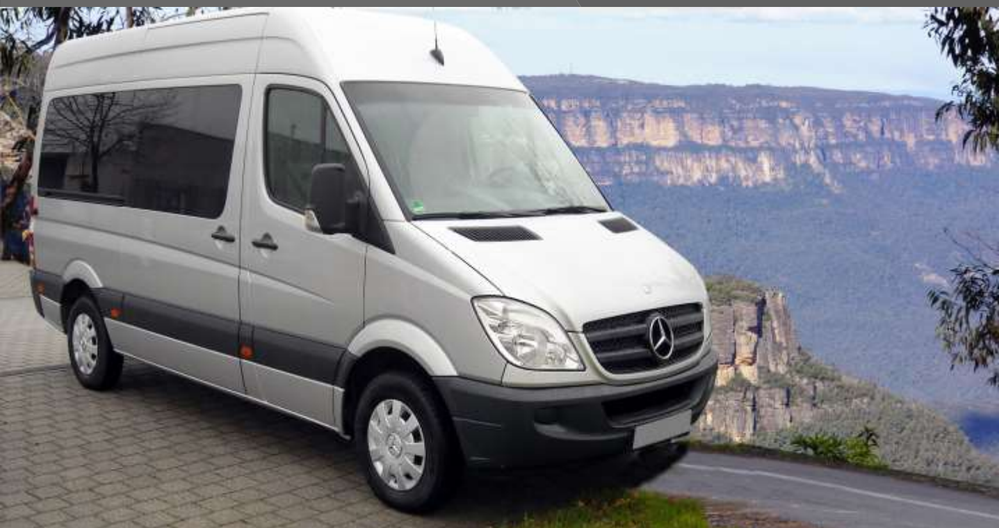
MERCEDES SPRINTER CDI 318 HIGH ROOF 12 SEATS